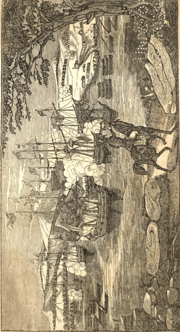
BATTLES OF LAKE CHAMPLAIN, AND PLATTSBURG ... COMMODORE M'DONOUGH, AND GENERAL MACOMR.